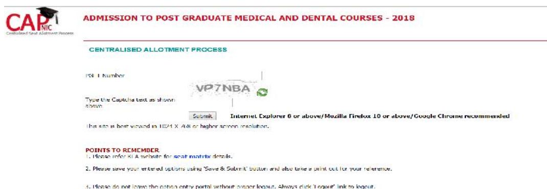
Fig 2 : After clicking PGET-2018–OPTION ENTRY